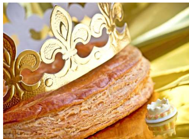
galette des rois

The festive season ends with the tirage du roi traditional ceremony on the evening of Epiphany (6 th January). At this function a scrumptious cake ( galette des rois ), the exact nature of which varies from region to region, is served in slices to the assembled company. Each guest wonders whether they will be the lucky ones to discover la fève , a tiny charm buried inside. The final festivity of the season is the ' tirage du roi ' on the evening of Epiphany (6th January). This is a 700 year old French tradition. One of the slices. There is a fève for the King and one for the Queen and the lucky ones don their crowns and become king and queen for the occasion.